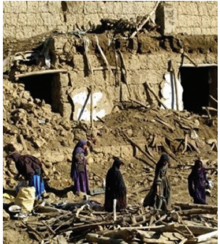
Afghan villagers stand on the debris of one of the houses which was allegedly bombed by a NATO air strike on Jabar village in the Nijrab district of Kapisa province, north of Kabul, Afghanistan Monday, March 5, 2007

Our invitation to Creech Air Force Base to join us for the program was respectfully declined.